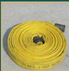
Filling and Draining Hoses