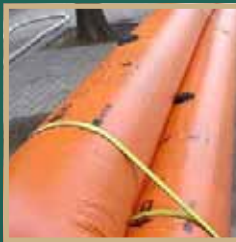
Tiger Dam Tubes

Plastic chocks are used to provide the maximum stability of the flood protection levee, especially if the ground is sloped. They are also helpful when building multilayered levees as they prevent the dam from sliding while being filled with water. Another part of the system is special anchoring screws, made from various materials to suit various types of ground soil to which the levees are anchored.