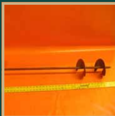
Anchors and Chocks